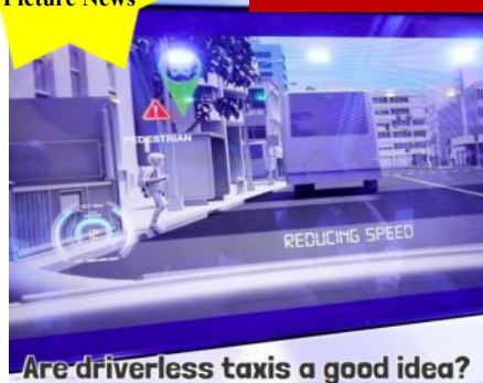
Are driverless taxis a good idea?